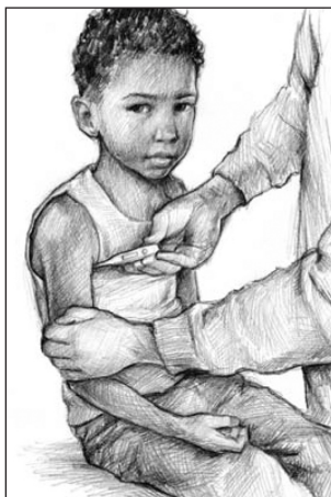
Axillary (under the child's arm)