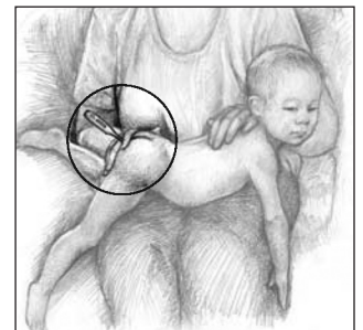
Rectal (in the child's bottom)— belly down