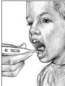
Oral (in the child's mouth)

Although not as accurate, if your child is older than 3 months, you can take his underarm temperature to see if he has a fever. The following is how to take an axillary temperature :